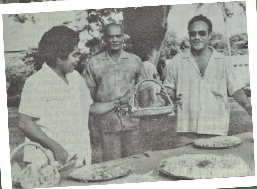
Fundraising for hurricane relief in Cook Islands, Vanuatu and Tokelau.