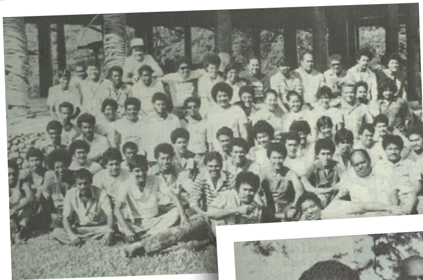
Students who took agricultural studies at Alafua campus.