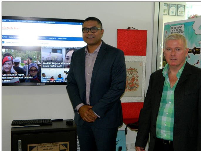
Fiji community meeting with the Auckland Mayoral Funds Committee, Ministry of Foreign Affairs, Red Cross and Pacific Leadership Forum in the wake of the TC Winston disaster.