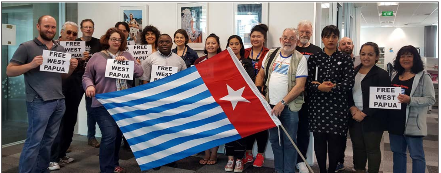
Supporters of a “Free West Papua” at the flag-raising ceremony.

ABOUT 20 academics, librarians, journalists, students and Pacific issues activists gathered at the Pacific Media Centre for a Morning Star flag-raising ceremony as part of global actions for West Papuan freedom.