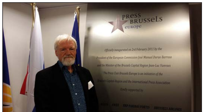
BELGIUM: Role of the Media in Violent Conflict conference in Brussels, 16 November 2016.