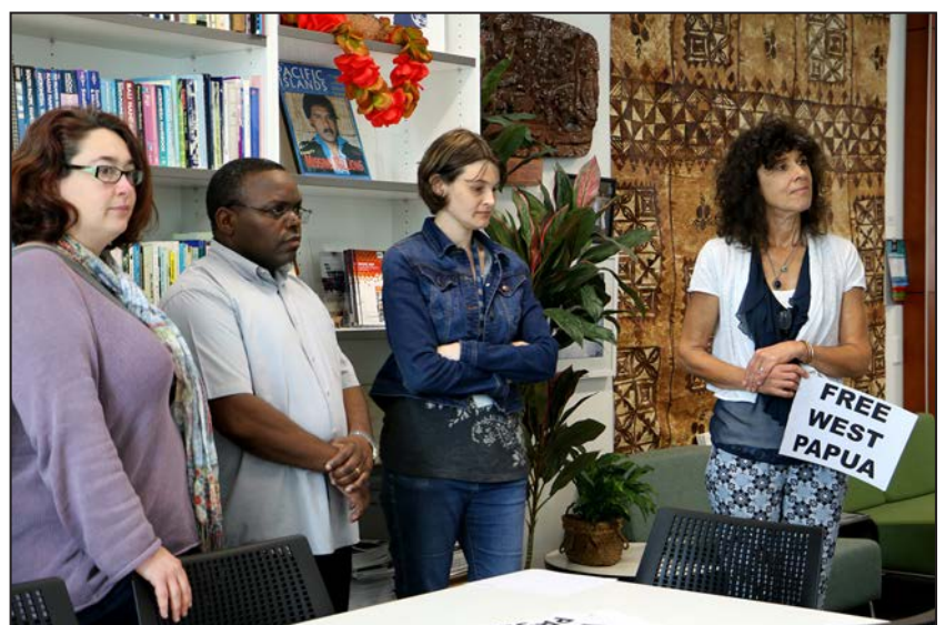
AUT librarians out in force for the West Papua solidarity flag-raising event at the Pacific Media Centre.