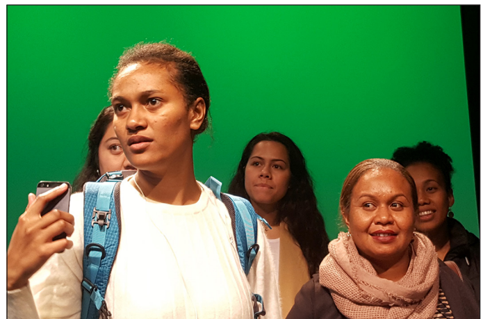
Pacific journalism students from Fiji and Samoa visit Pacific Media Centre, 29 June 2018.